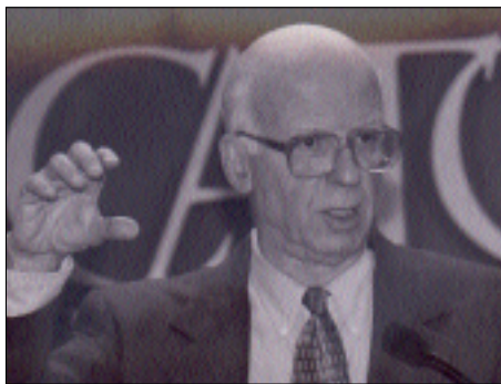
David Broder: "In this day and age, initiatives are both more sweeping in their content and more numerous than they have been for a very long time."

We are talking about a very large and money-driven process. In the 1998 election cycle I was able to verify at least $250 million spent on initiatives at the state level. That is about $100 million more than the taxpayers gave